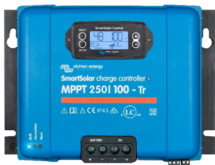
SmartSolar Charge Controller MPPT 250/100-Tr with optional pluggable display