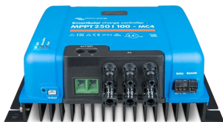
SmartSolar Charge Controller MPPT 250/100-MC4 without display