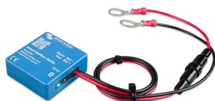
Bluetooth sensing: Smart Battery Sense