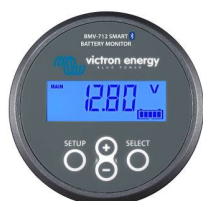
Bluetooth sensing: BMV-712 Smart Battery Monitor