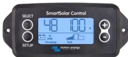
SmartSolar pluggable display

Simply remove the rubber seal that protects the plug on the front of the controller, and plug-in the display.