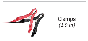
Clamps (1.9 m)