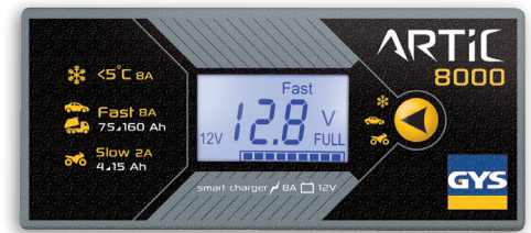
Easy to use